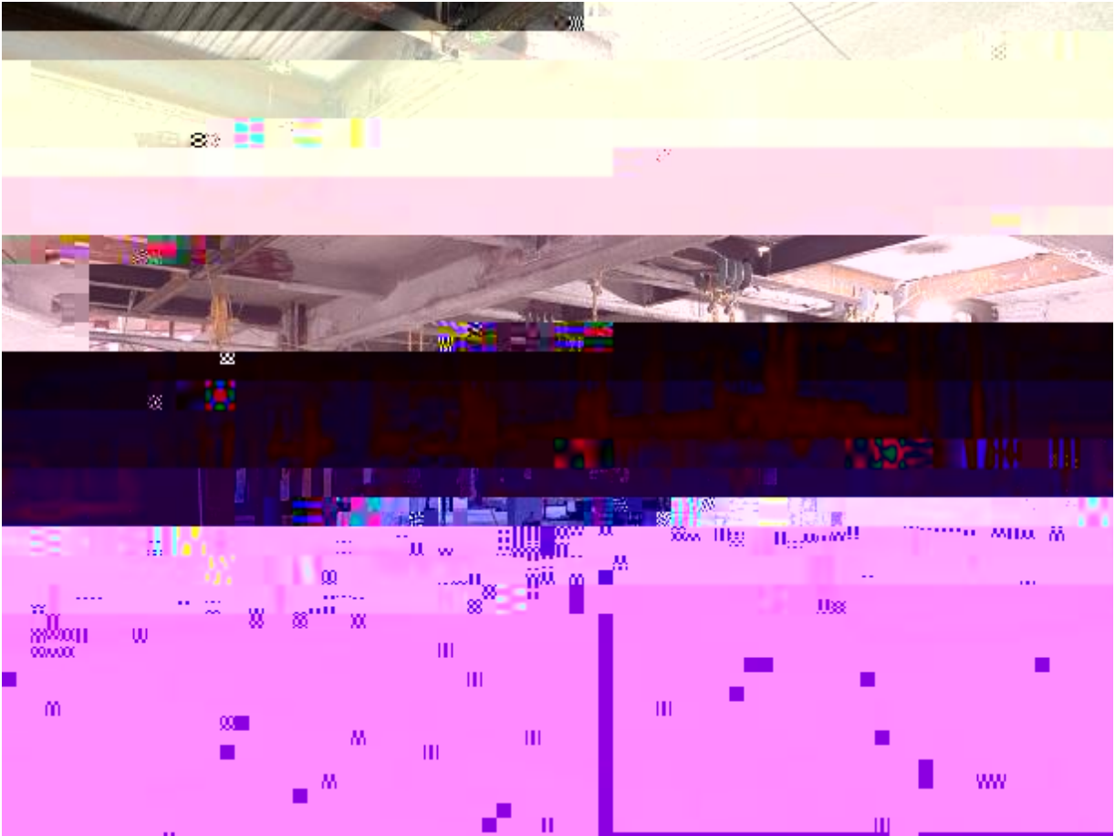
2 nd Floor Large Venue Grid Iron hanging is in progress.