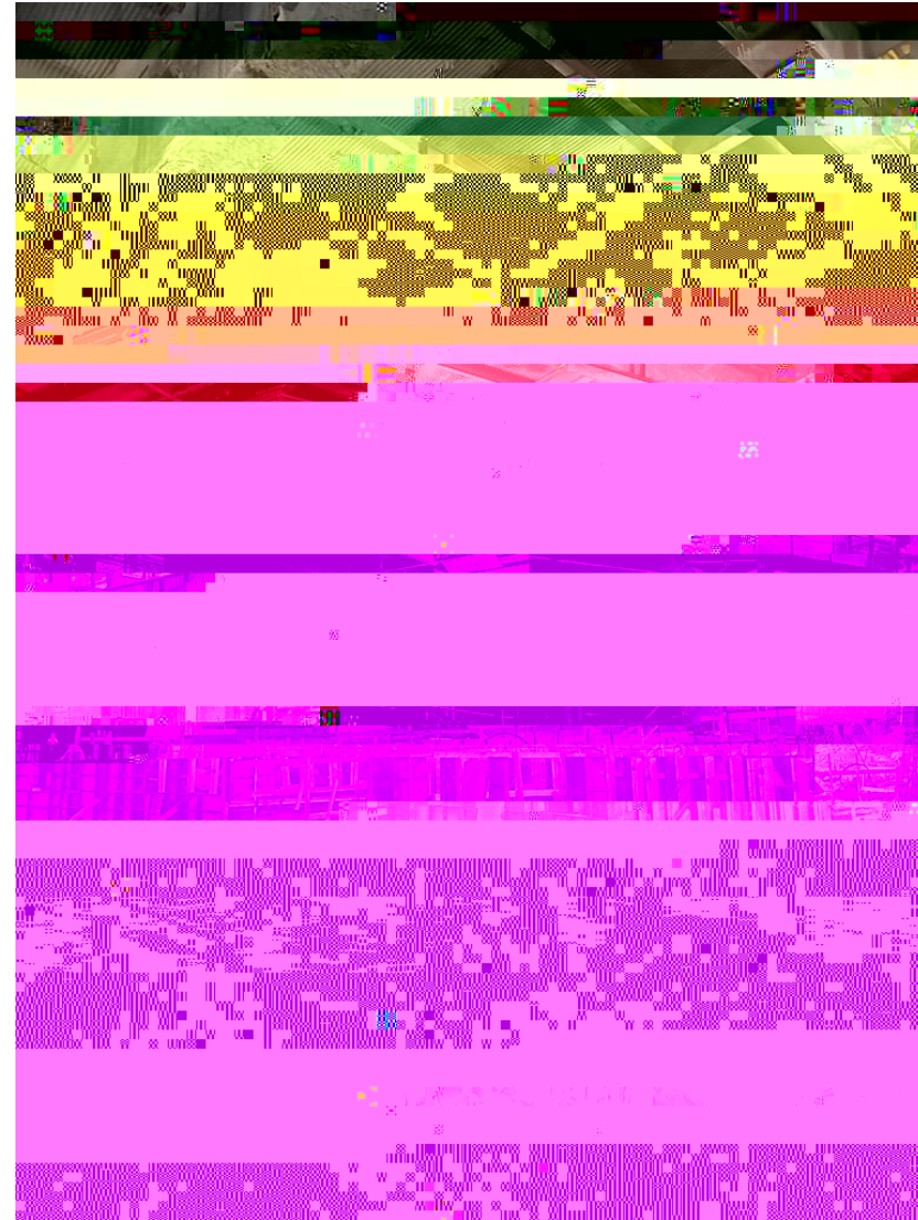
Continued rebar installation in the Large Venue.